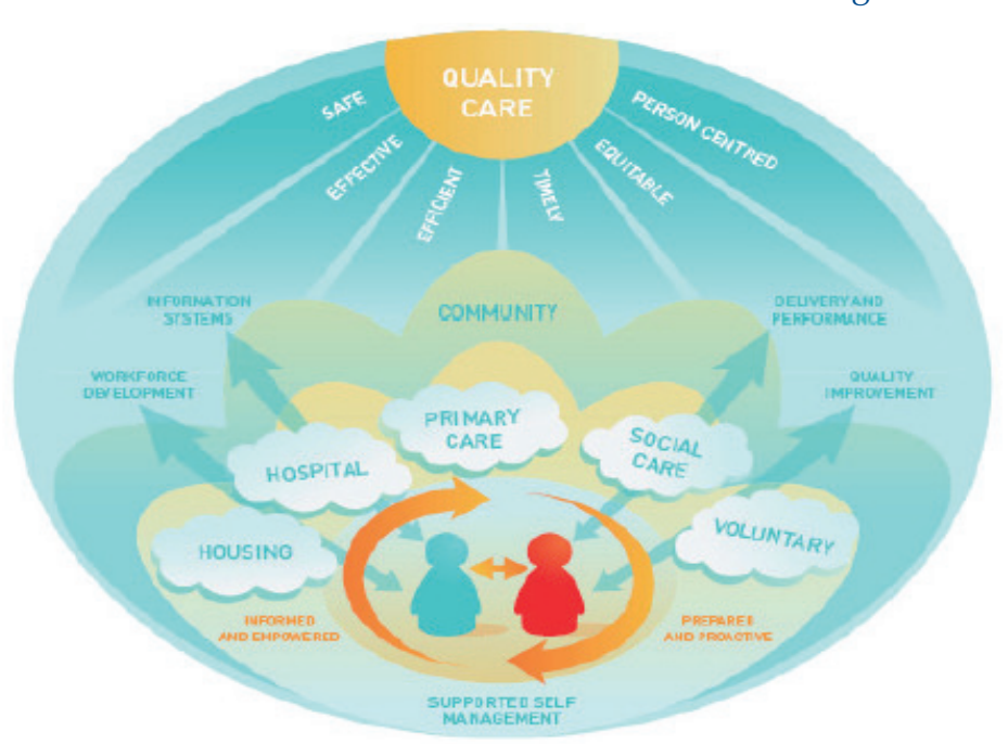
Figure 1: NHS Scotland Health and Social Care model for Long Term Conditions

The approach to long term conditions within Lanarkshire has over the last 5 years undergone major reconfiguration guided by the healthcare needs of the population and national strategies, including NHS Scotland's Quality Strategy (2010). The model implemented is based upon the Health and Social Care Model illustrated in figure 1 below (NHS Scotland 2007), which is based upon the Chronic Care Model developed by the Robert Wood Johnson Foundation in the USA.